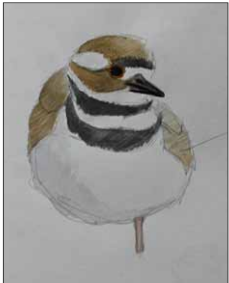
Pages from Eugene Archer's notebook showing sketches of the Killdeer at Comillane on 18th October 1996, (photo: Eugene Archer).