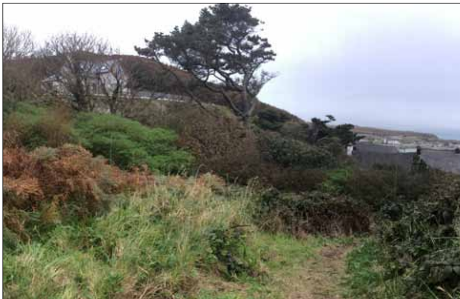
The famous Cotter's Garden, looking towards North Harbour, (photo: Tom Shevlin).