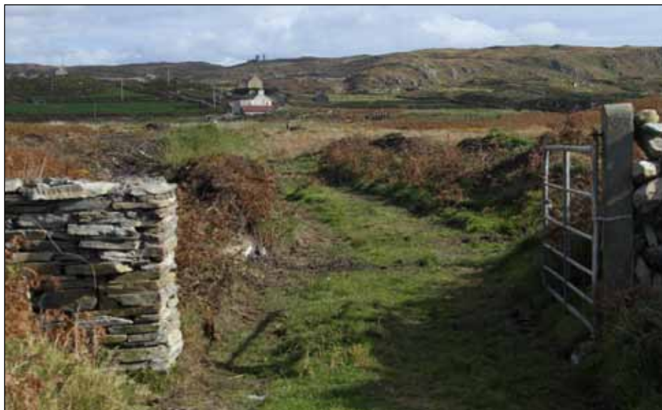
Looking west-northwest from Central Bog, with the Old Lighthouse in the distance