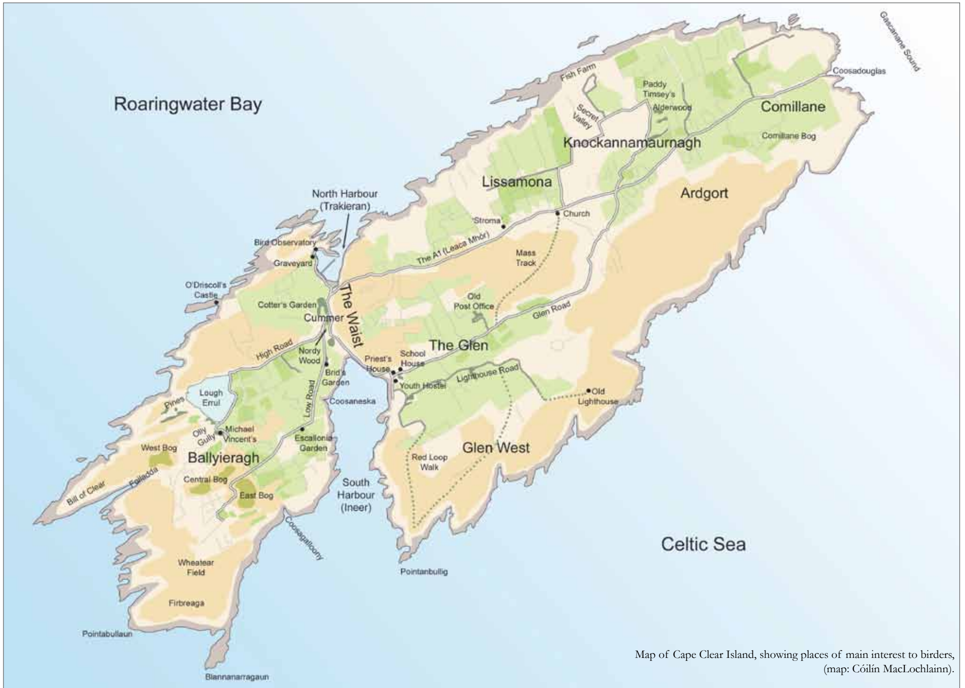
Map of Cape Clear Island, showing places of main interest to birders, (map: C  il  n MacLochlainn).