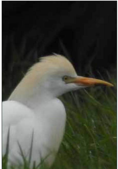
Cattle Egret , Lough Errul, 29th March 2017, (photo: Mary Cadogan).