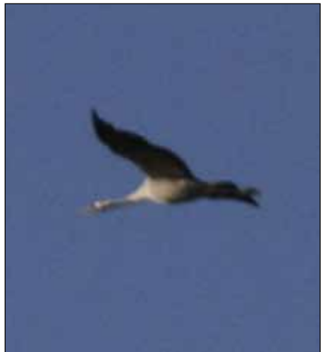
Crane , in flight over The Glen, 5th November 2011, (photo: Aidan G.Kelly).