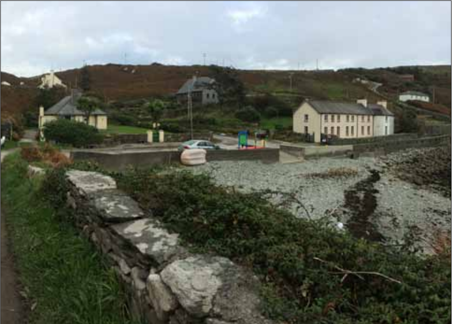
The Glen and Lighthouse Roads, with the Priest's House, School and Youth Hostel