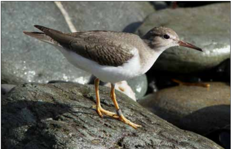
Spotted Sandpiper , South Harbour, 10th October 2017, (photo: Dick Coombes).

Status in Ireland: Very rare vagrant with 46 records.