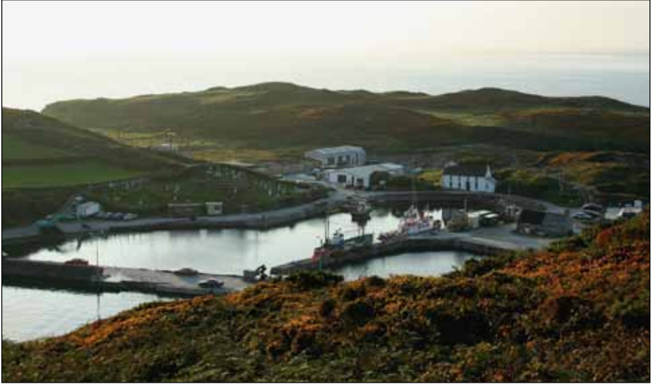
North Harbort from the A1, (photo: Dick Coombes).