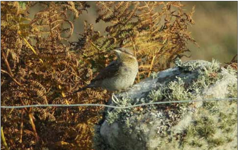
Wryneck , Central Bog, 8th October 2013, (photo: Dick Coombes).