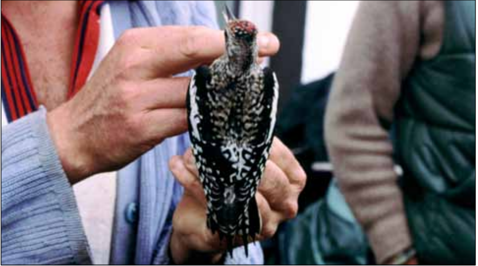
Yellow-bellied Sapsucker , in the hand, 16th October 1988, (photo: Kieran Fahy)