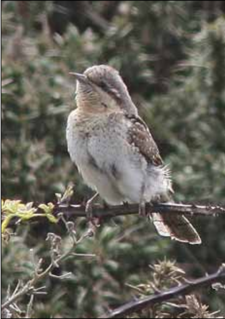
Wrynecks, East Bog, 22nd April 2010 (left), Central Bog, 24th September 2013 (right)