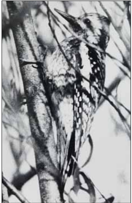
Yellow-bellied Sapsucker , Cotter's Garden, 19th October 1988, (photos: Eamonn O'Donnell).