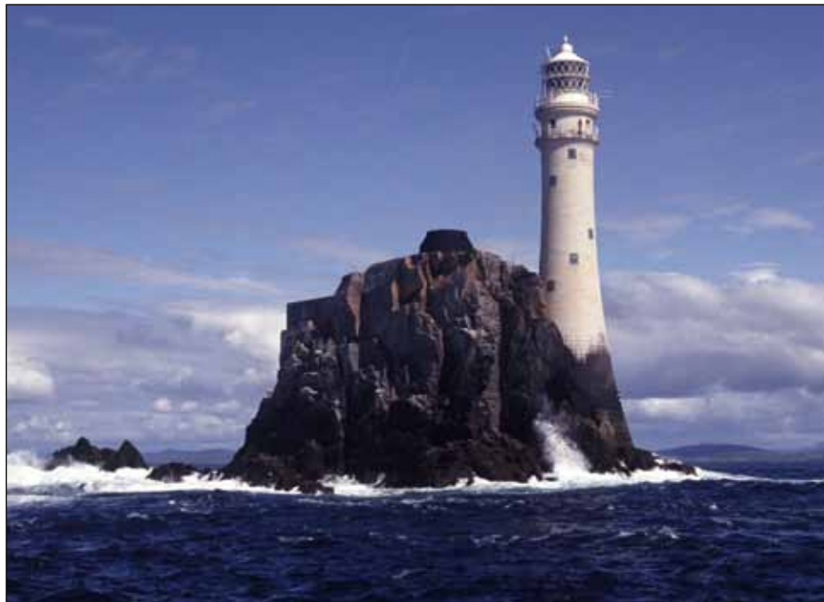
The Fastnet Rock and its lighthouse, (photo: Dick Coombes).