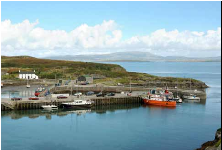
North Harbour and Bird Observatory (white building), (photo: Richard T. Mills).

Watmough, N. 1988. Yellow-bellied Sapsucker in County Cork. Birding World 1(11): 392-394.