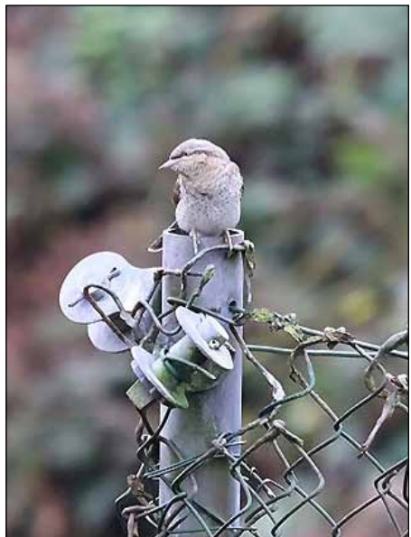
Wryneck, The Waist, 9th (left) and 10th (right) October 2011