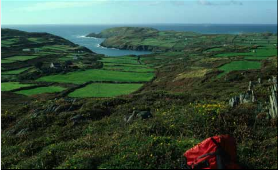
South Harbour and the point of Blanan and from the A1 with the Post Office centre-left.