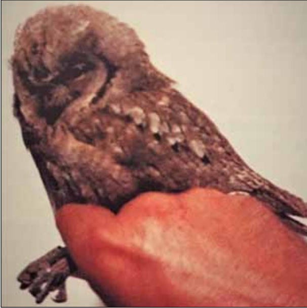
Scops Owl , in the hand, 17th May 1999, (photo: Eamonn O'Donnell).