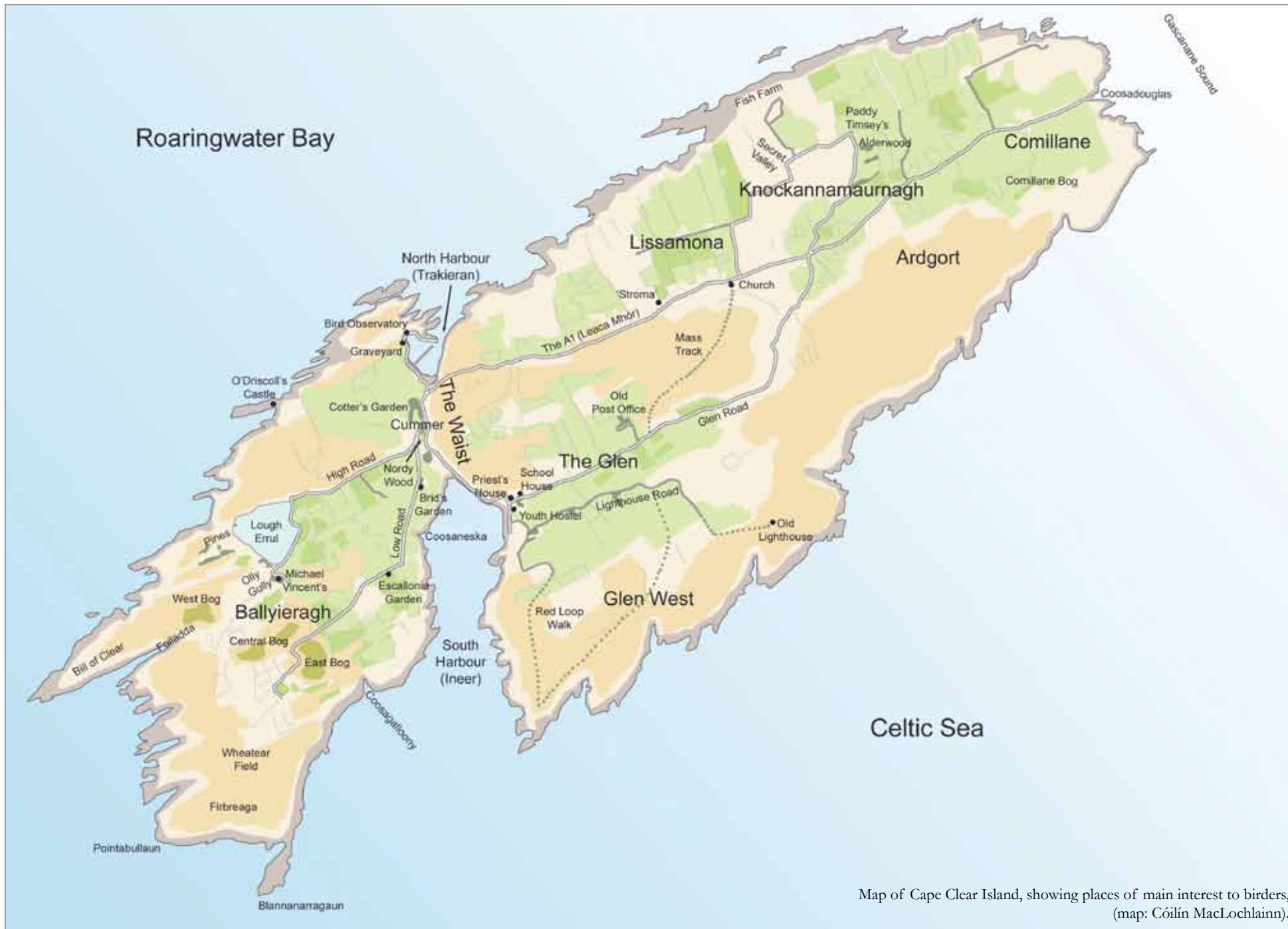
Map of Cape Clear Island, showing places of main interest to birders, (map: C  il  n MacLochlainn).