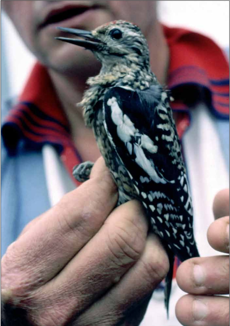
Yellow-bellied Sapsucker, in the hand, 16th October 1988, (photo: Kieran Fahy)