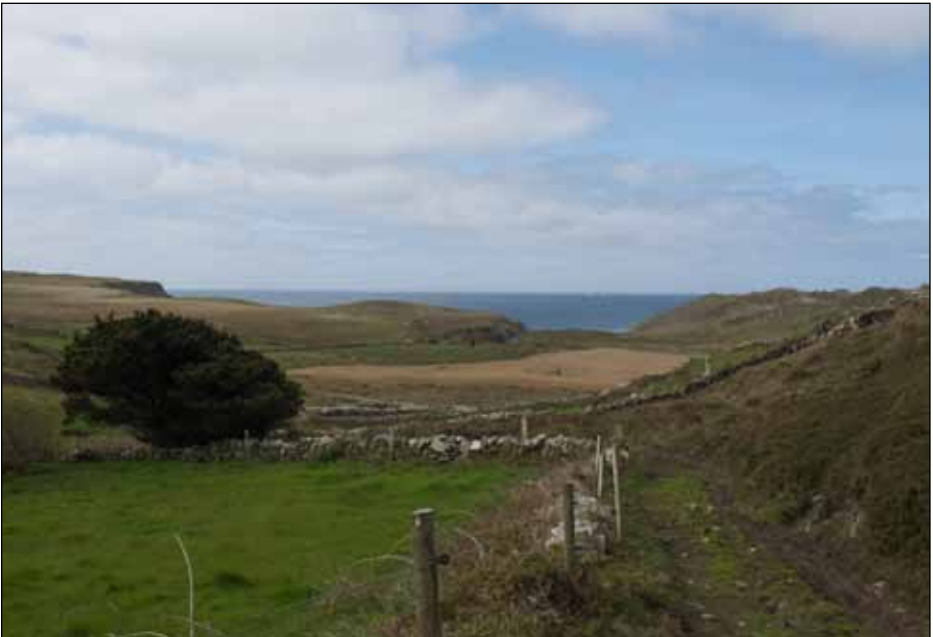
Olly Gully and the West Bog