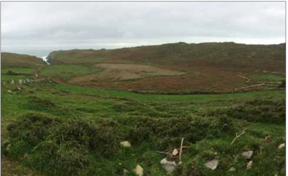
West Bog looking towards the Bill of Clear, (photo: Tom Shevlin).